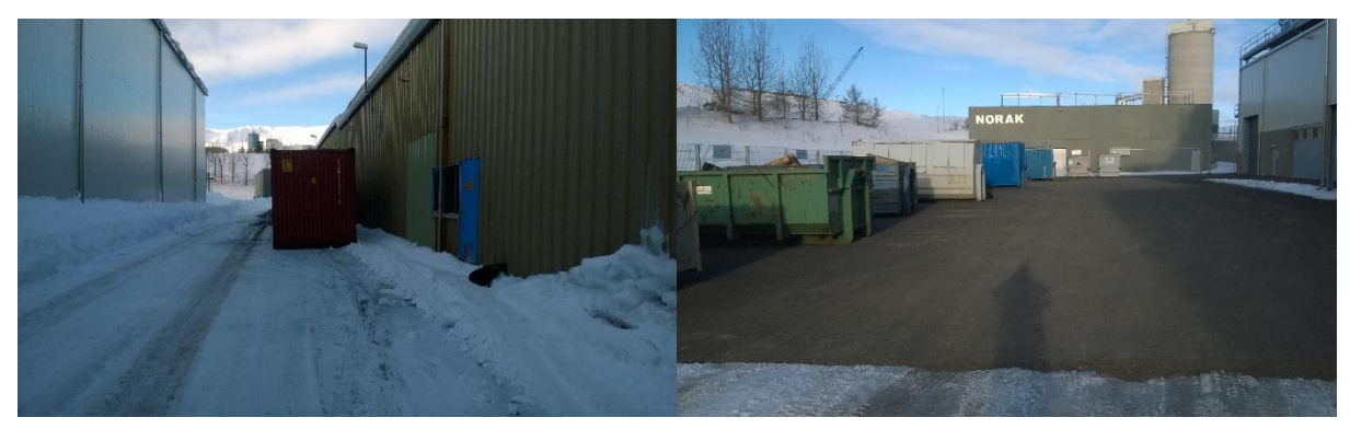
Picture 2-3: Measurements at the working area Picture 2-4: Measurements at the container area of Laxá